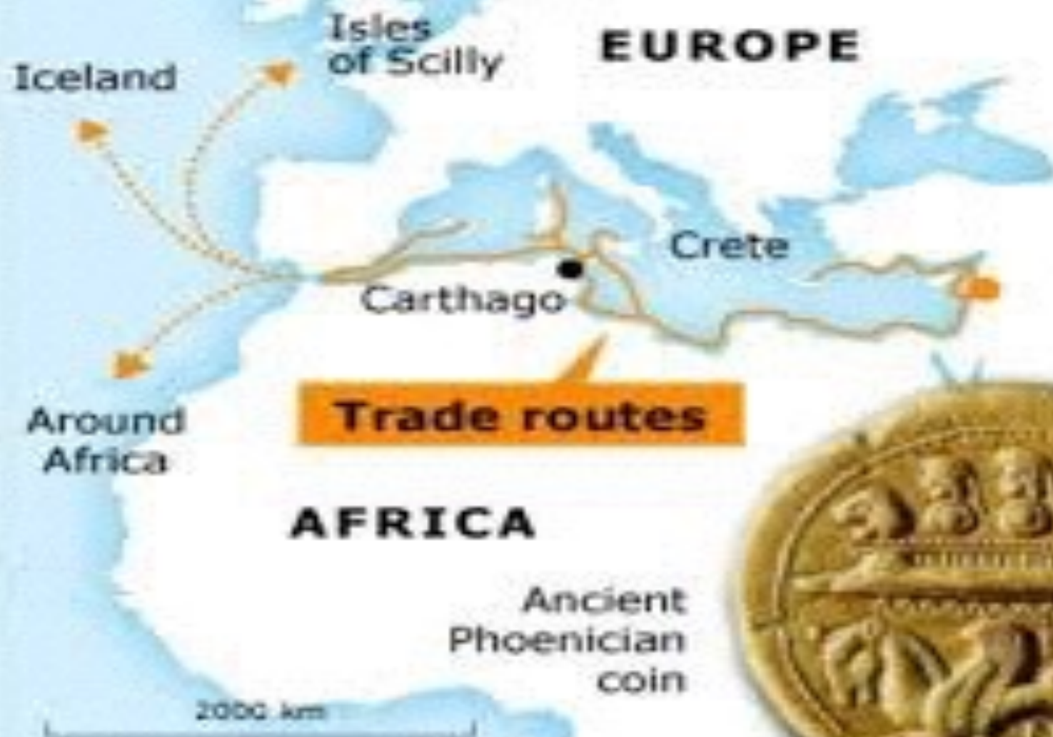
Ancient Phoenician coin